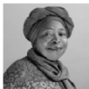
NKOSAZANA DLANINI ZUMA

SOUTH AFRICAN MINISTER OF HEALTH (1994-1999)