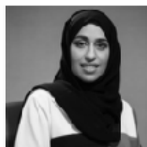
HESSA ESSA BUHUMAD

PRIME MINISTER OF NEW ZEALAND (1999-2008)*