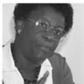
MARIA LIBERIA PETERS

PRIME MINISTER OF FINLAND (2010-2015) AND DEPUTY SECRETARY GENERAL OF THE OECD*