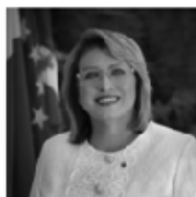
MARIE-LOUISE COLEIRO PRECA

PRIME MINISTER OF NETHERLANDS ANTILLES (1994-1996, 1998-1994)*