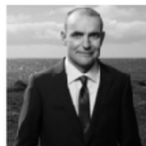
GUDNI TH. JÓHANNESSON

PRESIDENT OF LITHUANIA AND CHAIR OF CWWL