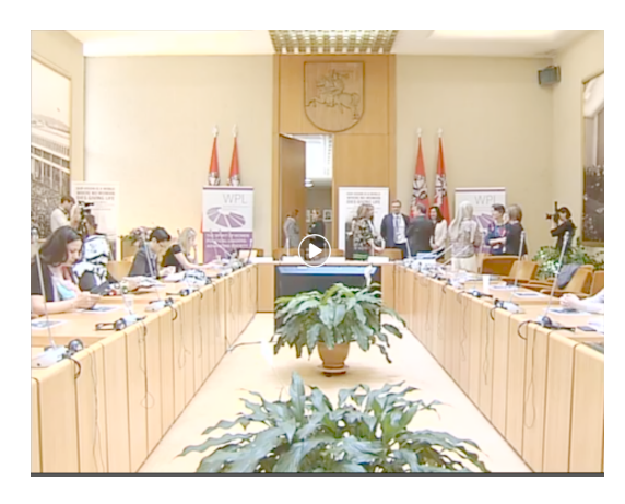
Money or Mentorship: How can politicians and Financiers team up for Women's Economic Empowerment?

Equal Access to Maternal Healthcare in the EU: A Reachable Goal – Let's push for action now!