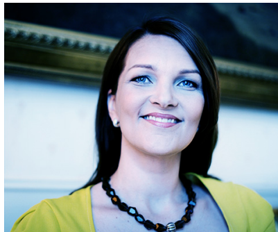
Mari Kiviniemi Deputy Secretary General, OECD; Former Prime Minister of Finland (2010-2011) Co-chair of the Women Leaders Global Forum

If women are to have the same opportunities as men to lead in politics, more needs to be done to effectively level the playing field. As long as the glass-ceiling for women leaders continues to be a cultural issue, sound work-family reconciliation, including shared caring responsibilities with men, institutional legal measures and awareness raising and training are key policy options to enable women leaders.